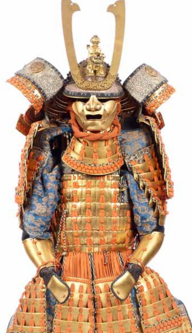
A Japanese haramaki-style suit of armour 20th century Estimate: AUS $4,000 - 8,000