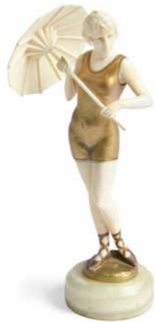
Ferdinand Preiss 'Bather with Parasol' a bronze and carved ivory figure, circa 1925 Estimate: AUS $16,000 - 20,000