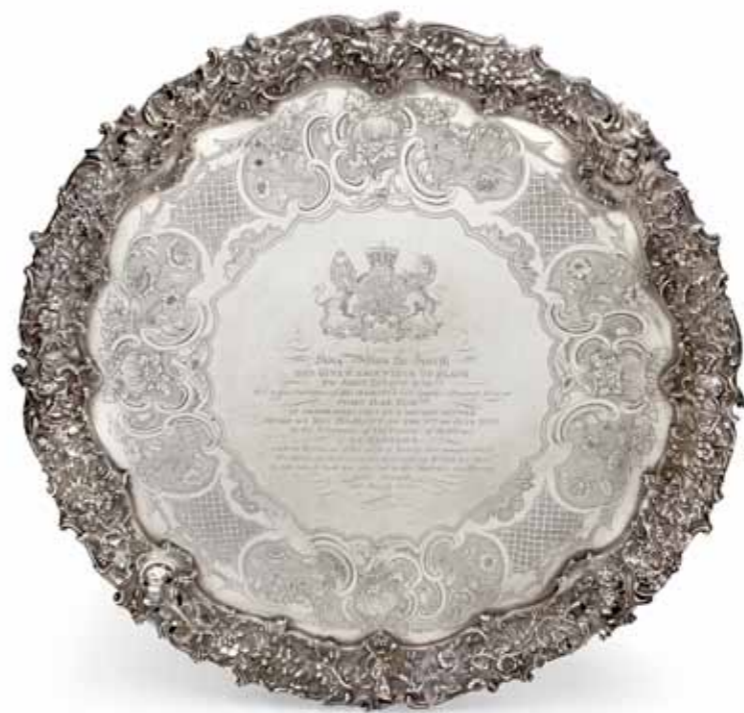
A large George IV Royal presentation silver salver, London 1835 by William Elliot with the Royal Arms Estimate: AUS $25,000 - 35,000