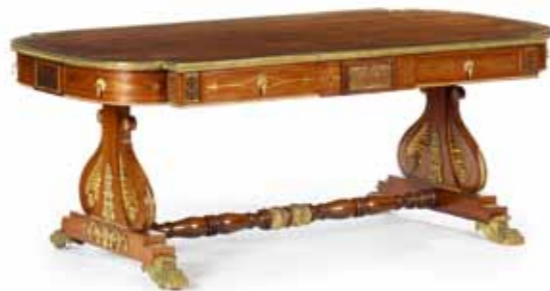
A fine Regency rosewood cut brass inlaid and gilt metal mounted library table Estimate: AUS $24,000 - 32,000