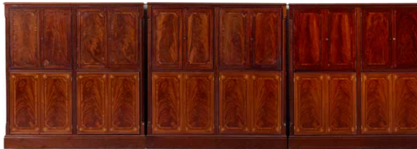
The Sir Joseph Banks collector's cabinets Estimate: AUS $250,000 - 350,000