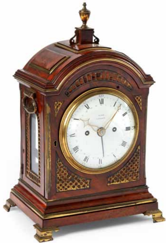
A fine late 18th century English brass-mounted triple-pad top bracket clock with enamel dial Estimate: AUS $12,000 - 16,000

The sale offers a unique opportunity to acquire objects from a world class collection.