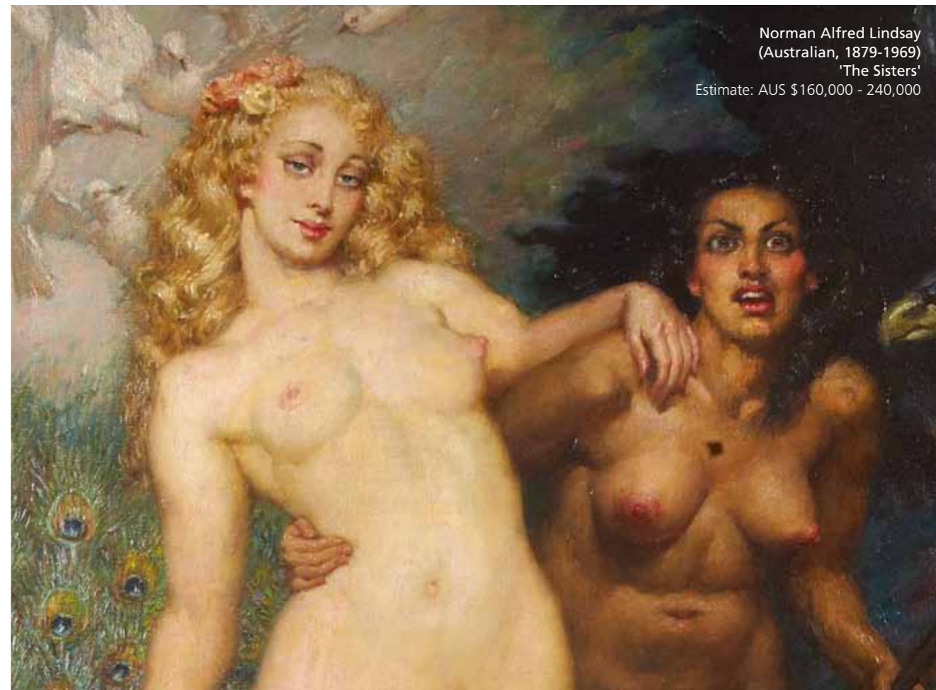
Norman Alfred Lindsay (Australian, 1879-1969) 'The Sisters' Estimate: AUS $160,000 - 240,000