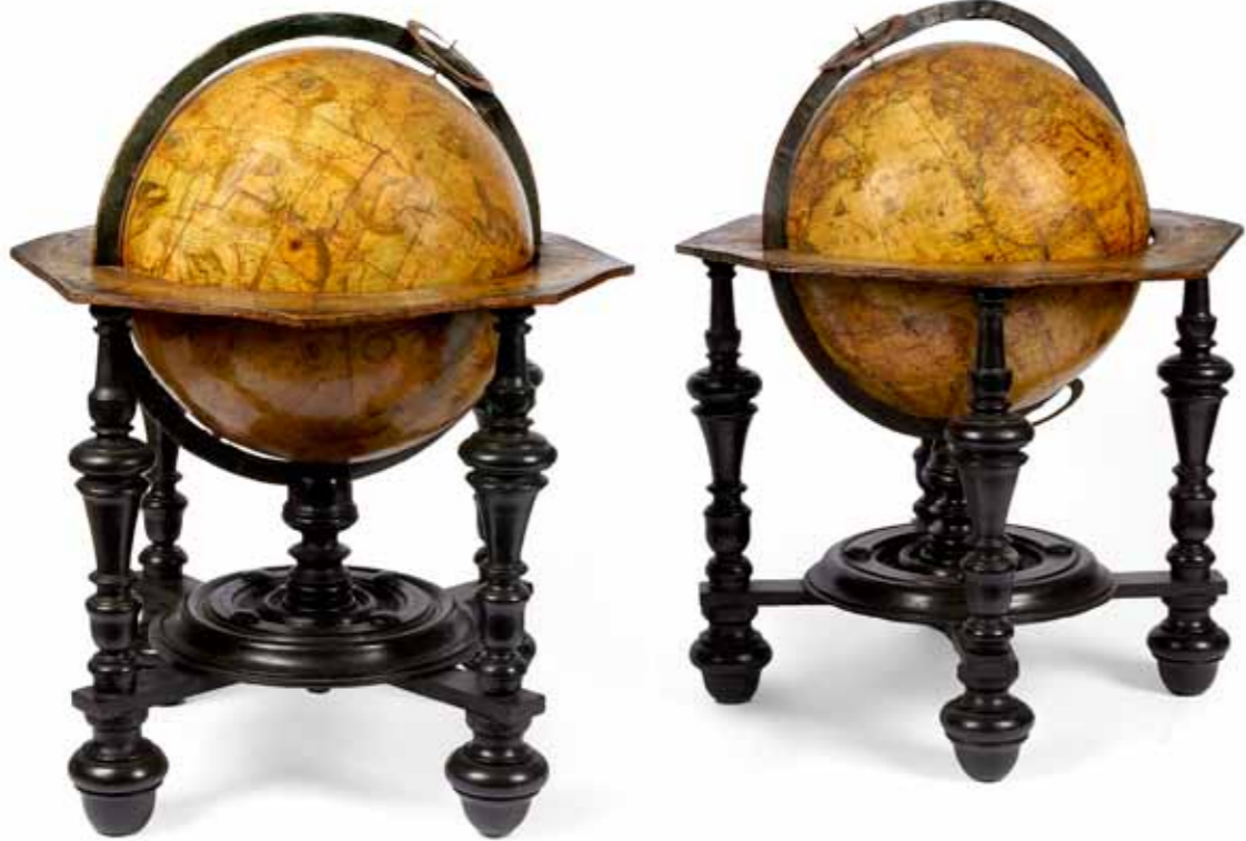
A rare matched pair of 18th century French celestial and terrestrial table globes Estimate: AUS $15,000 - 20,000