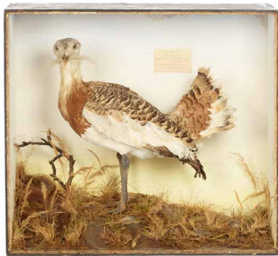
A historically interesting male great bustard, one of the last surviving bustards shot on Salisbury Plain, circa 1871 Estimate: AUS $2,000 - 3,000