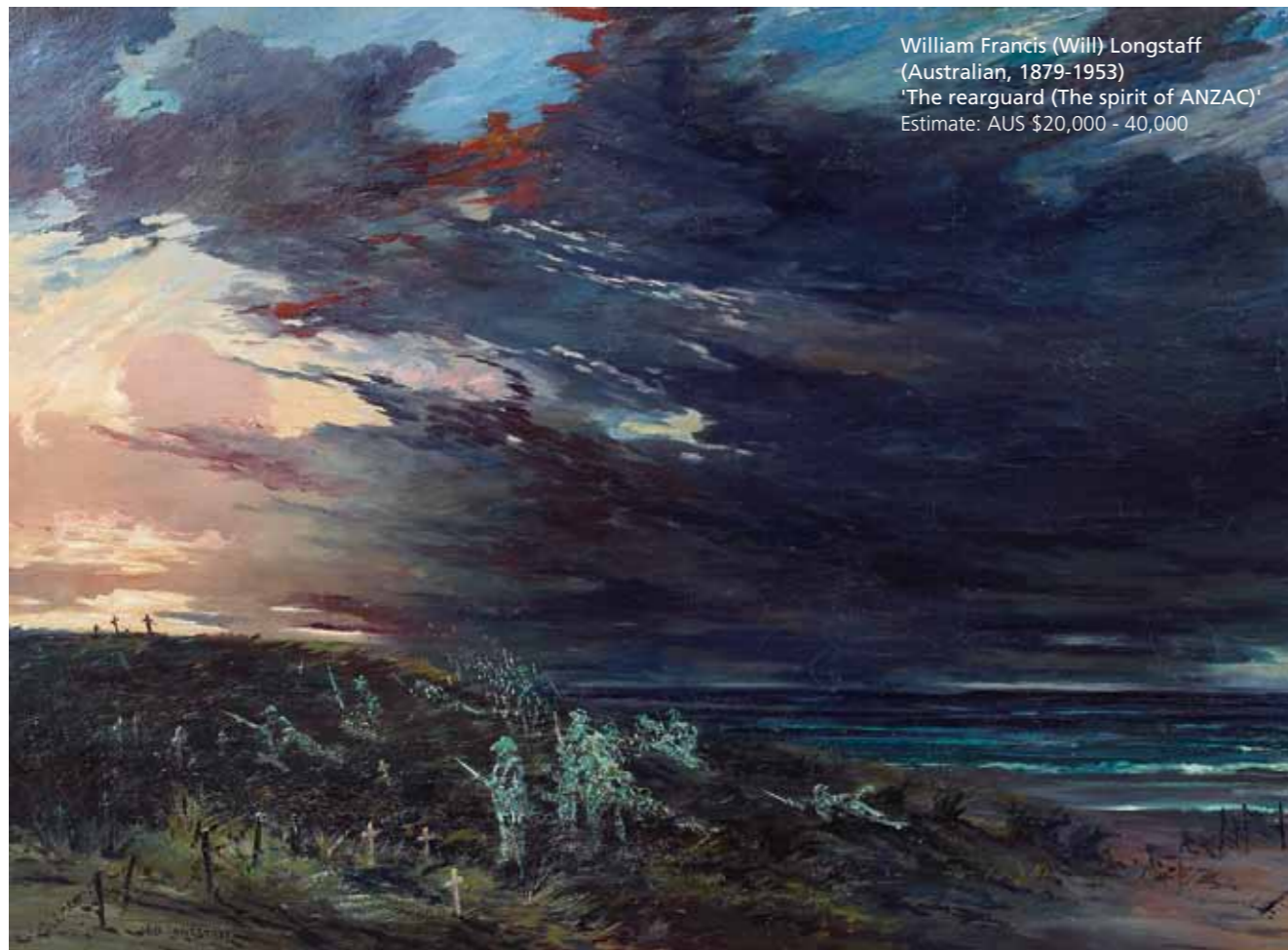
William Francis (Will) Longstaff (Australian, 1879-1953) 'The rearguard (The spirit of ANZAC)' Estimate: AUS $20,000 - 40,000